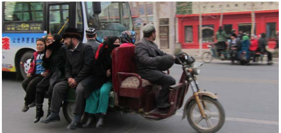
Figure 2. A shared taxi in Uighur province in China.

Bike taxis prevail in many areas such as in China, India, Thailand, and there are so many names for them: "Rickshaw" in India, "Tuk-Tuk" in Thailand, "San Lun Chu Zu Che (三轮车出租车)" in China, and "Tricycle" in the Philippines.