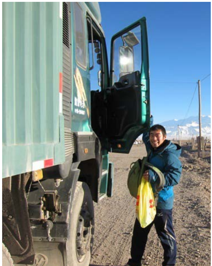
Figure 4. Hitchhiking a ride in Kyrgyzstan.

I hope you enjoy these and find them helpful as travel tips. Have a great trip!