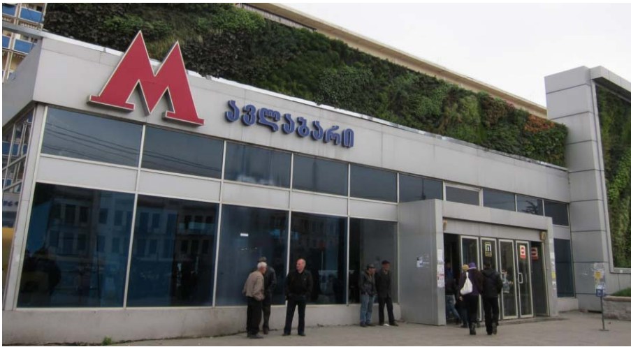
Figure 1. The main subway station in Georgia

to the stations on railway. If you get off at the wrong station, then you go back the same way. You will notice the minor differences like ticketing or the train body. It's interesting to observe the behavior of locals when you are on board.