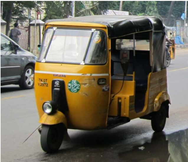
Figure 3. A rickshaw in India.

Just make sure to set the deal before you get on it. Otherwise, you might be in trouble when you get off. It is always fun to chit chat, and it's also fun to negotiate the price.